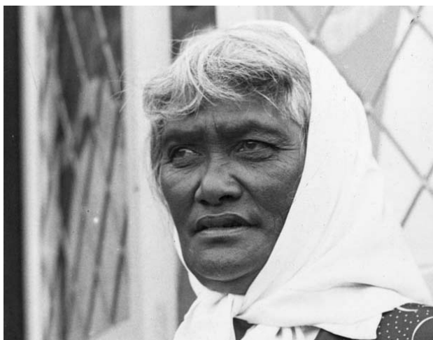
Te Puea Herangi (1883-1952)

Find Resources for further study at the end of The Fire Keeper's Girls .