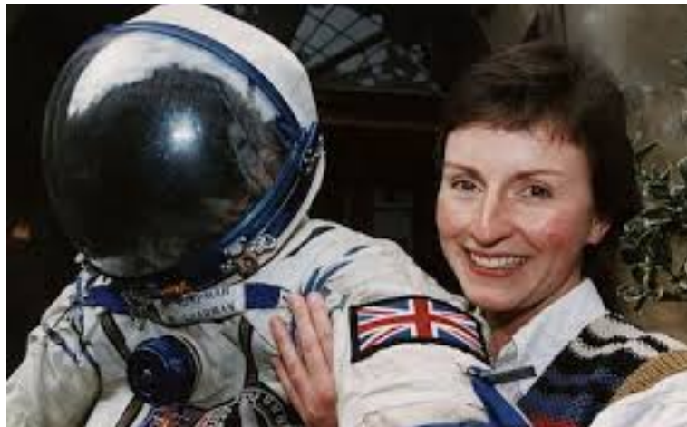
Helen Sharman, Britain's first astronaut in 1991, was already forgotten by the British media when in 2016 they claimed Tim Peake would be the first Brit into space.

What skills could you offer? What skills would you be willing to learn?