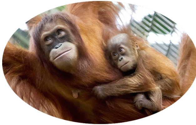
Orangutan mother and baby