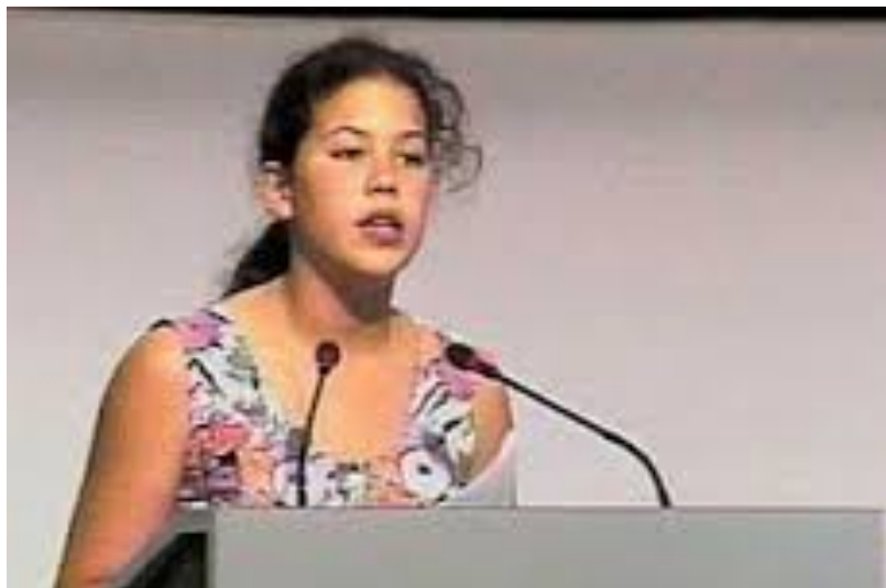
Severn Suzuki speaks to world leaders

Discuss with a partner or in a small group how Severn influences her audience. Which of her skills would you most like to duplicate?